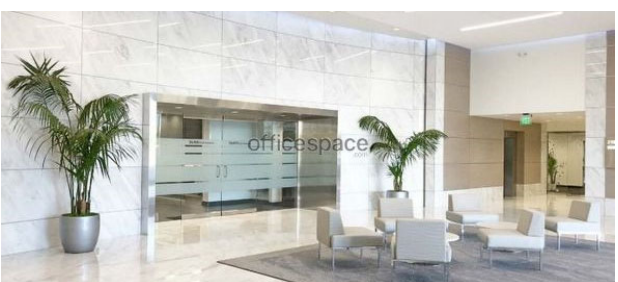
Enter the building and go to the right. Suite101